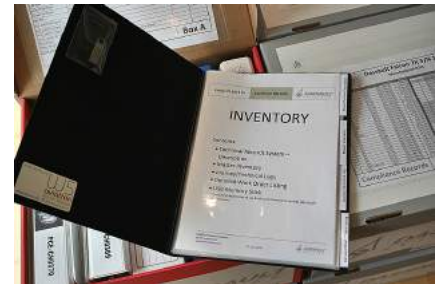
4 Issue master inventory list