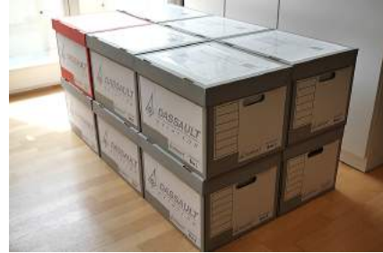
5 Ready for shipping records