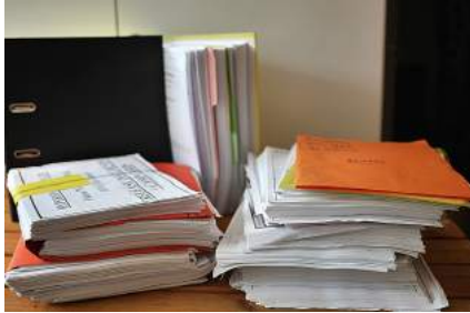
1 Receive hard-copy records