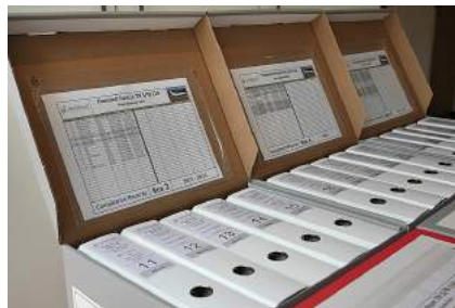
3 Reorganize in binders & boxes